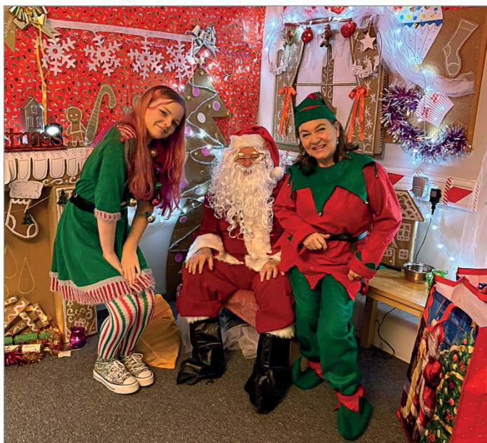
Two elves assisted Santa at the Children's Party

Training will take place at the Longhoughton Community and Sports Centre during the first two weeks in February.