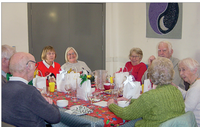
Residents enjoying the 2025 Christmas Lunch